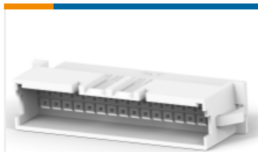
TE Part # 3-2323745-2 HSG,REC,PANEL MOUNT,GWT, DUALROW,EP2.5