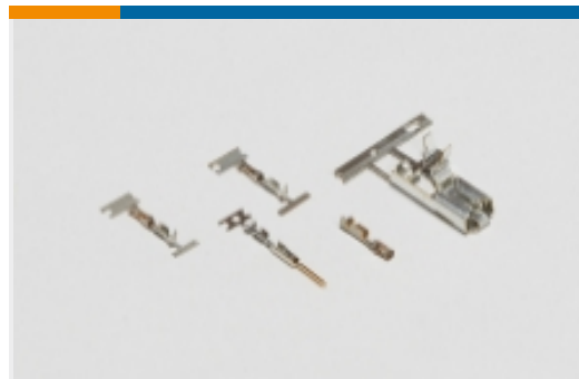
Wire-to-Board Connector Contacts(6)