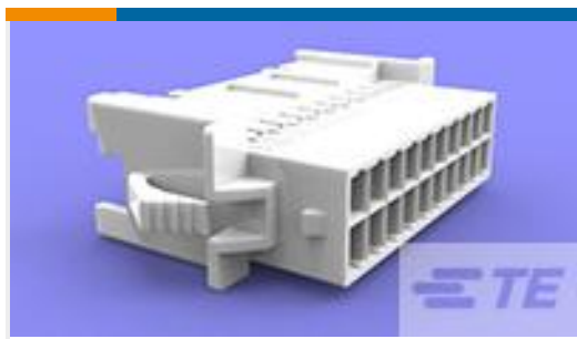
TE Part # 1969595-8 HSG,REC,FREE-HANGING,GWT, DUALROW,EP2.5